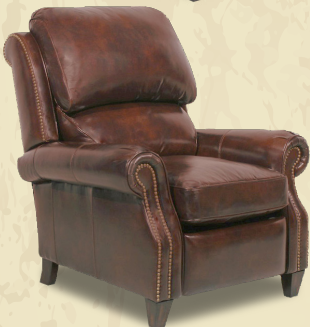
Leather: Double Fudge All Leather 5404-41