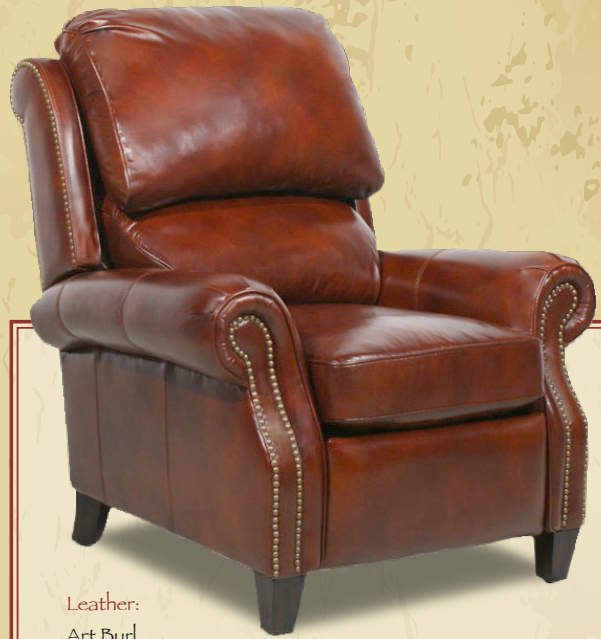
Leather: Art Burl All Leather 5406-42