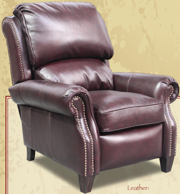
Leather: Chateau Bordeaux All Leather 5443-85